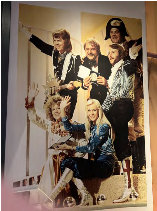
Picture 1 PHOTO OF ABBA'S EUROVISION TRIUMPH, 6 th APRIL 1974. ABBA THE MUSEUM, STOCKHOLM