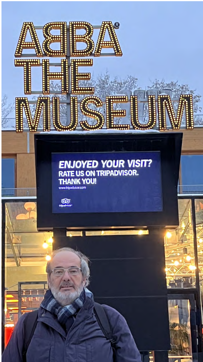
The author at ABBA The Museum in Stockholm 7 th December 2023.